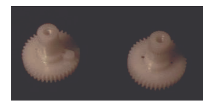
(Click on picture for larger view)

An unmodified (left) and modified output shaft gear